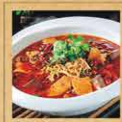
金牌毛血旺 23.99 Signature Spicy Pot Stew