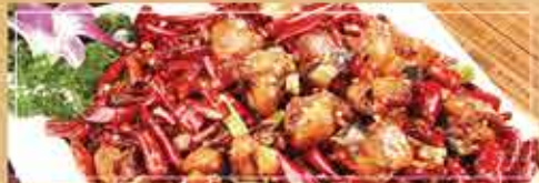
重庆辣子鸡 14.99 Chongqing Spicy Chicken