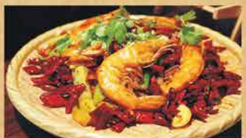
香辣虾 17.99 Spicy Shrimp