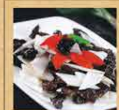
寻炒淮山 13.99 Stir Fry Chinese Yam