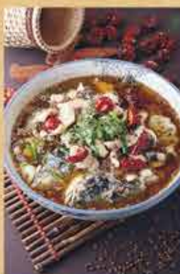
麻辣诱惑鱼 42.99 Spicy Pot w. Sliced Fish (龙利鱼/鲶鱼)