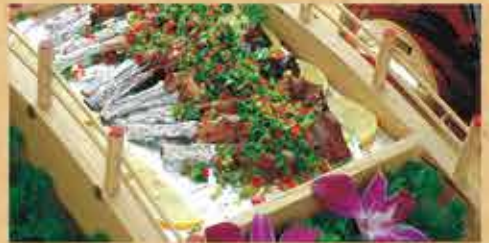
孜然羊排 27.99 Cumin Lamb Chops