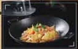
干锅包菜 13.99 Stir Fry Cabbage