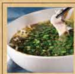
招牌青椒鱼 42.99 (龙利鱼/鲶鱼) Signature Pepper Pot w. Sliced Fish