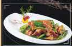
回锅肉 13.99 Twice-cooked Pork