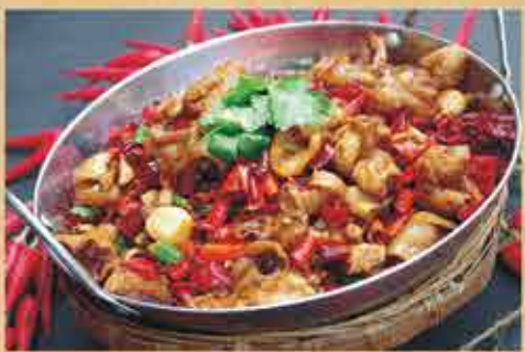
干锅肥肠 17.99 Griddle Cooked Intestine