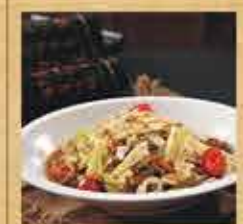
泡椒黄喉 16.99 Stir Fry Beef Aorta w. Pickled Pepper