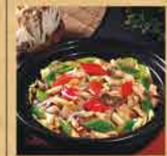
野菌煲 15.99 Stir Fry Mix Mushroom