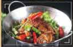
干锅牛仔骨 18.99 Griddle Cooked Short Ribs