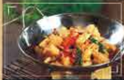
干锅花菜 14.99 Griddle Cooked Cauliflower