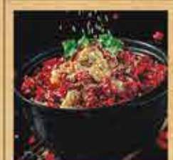
干锅牛蛙 23.99 Griddle Cooked Frog